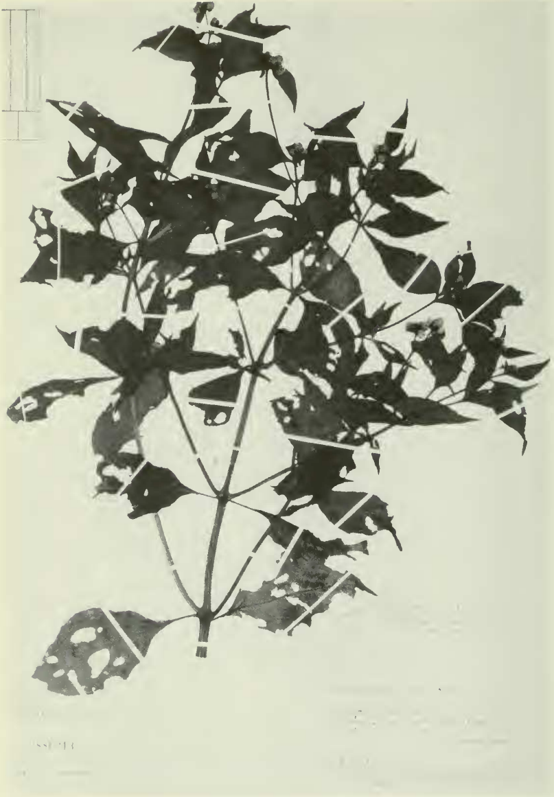
Ichthyothere petiolata H. Robinson, Isotype, United States National Herbarium.